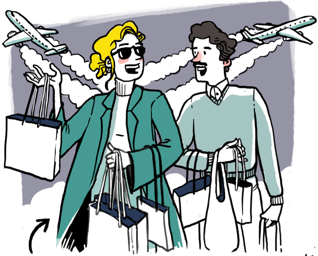
Weekend shopping trips: bullshit