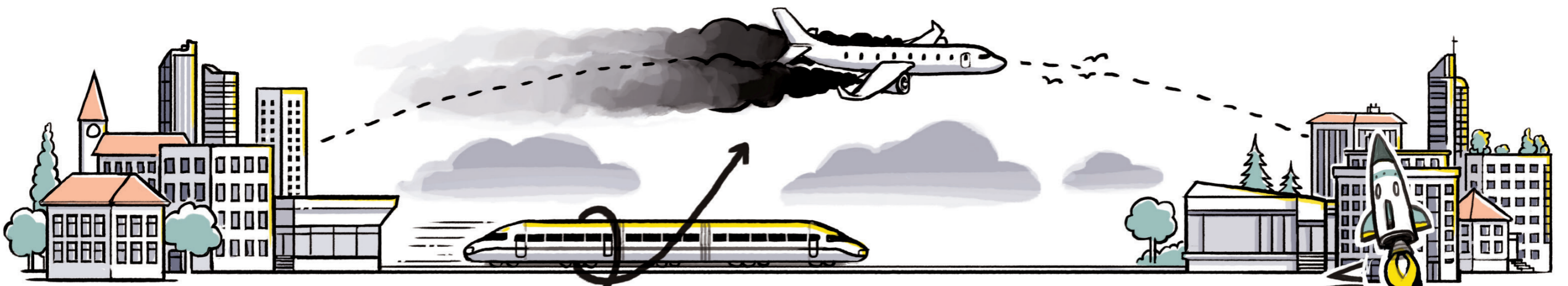
Short haul flights: bullshit