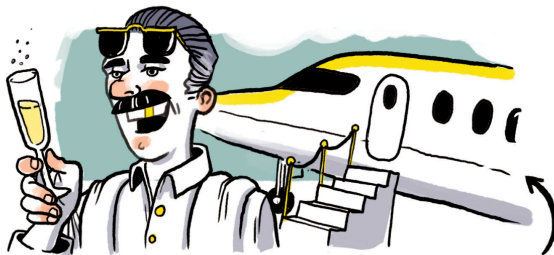
Private jets: bullshit