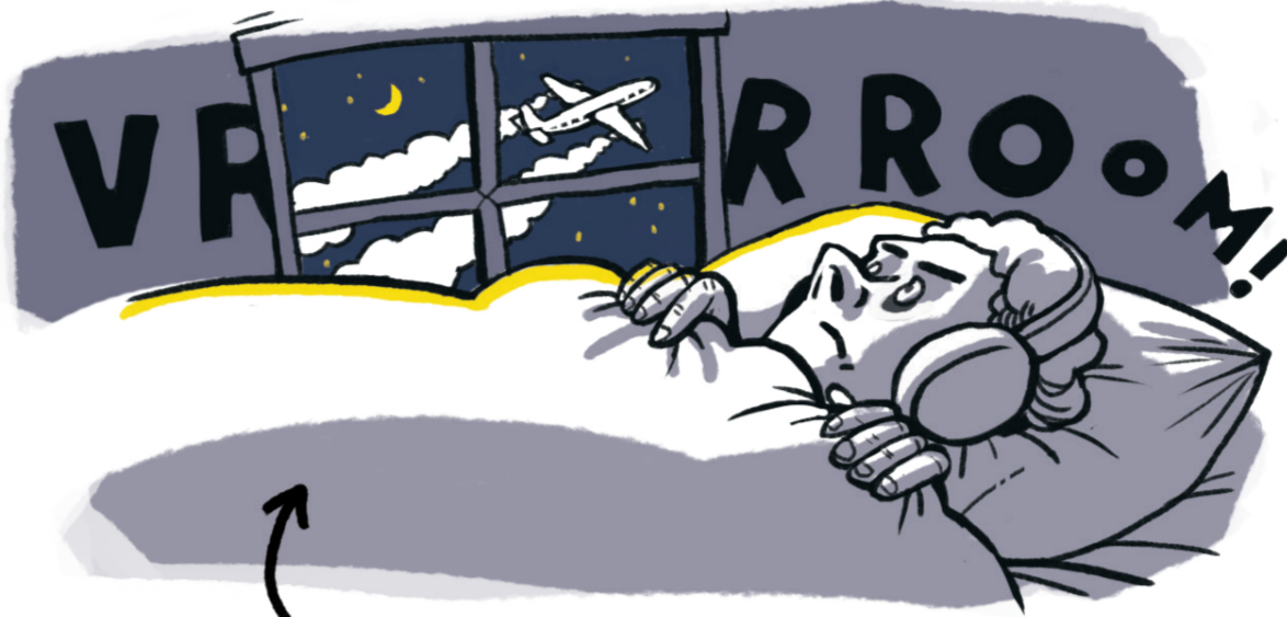
Night flights: bullshit