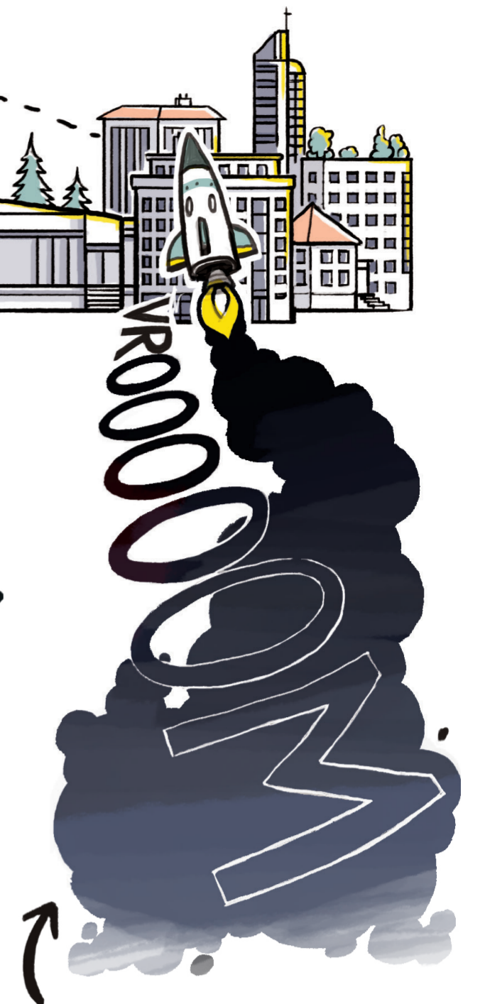
Space Tourism: bullshit